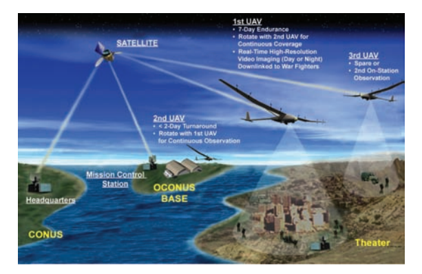
Diagram 1. Operational Concept of the HALE UAS

Global Observer is the latest development in High Altitude Long Endurance (HALE) UAS, which will be able to provide long-dwell stratospheric capability with global range and no latitude restrictions.