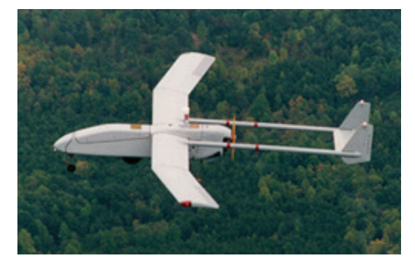
Shadow 600 supports military requirements in several U.S. allied nations, operating in diverse and rigorous climate and terrain conditions.