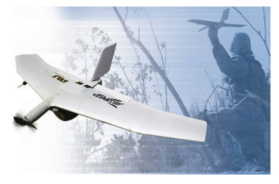
The Wasp MUAS is a small, portable, reliable, and rugged unmanned aerial platform with a wingspan of